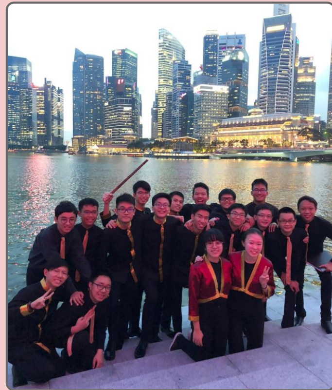
Chuiguan with Y56 seniors before the 2019 Esplanade Concert